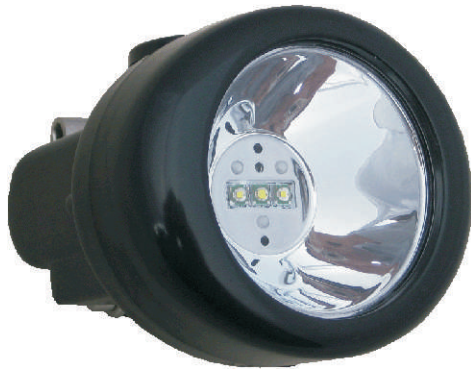
Ex ia IIA T3 IP67

The KH3E-Ex is our flagship model. It is the brightest in our Cordless Miner's Caplamp Series and is charged through external electrodes. The KH3E-Ex has three LEDs. The Main LED, in the middle of the reflector, is used for both normal and high-beam illumination. The two Emergency LEDs, located on each side of the Main LED, operate for extended periods of time during an emergency. KH3E-Ex features superior illumination, weighs less than 150g, and is lighter than the headpiece of a traditional caplamp. It is highly suitable for underground applications in metalliferous mines.