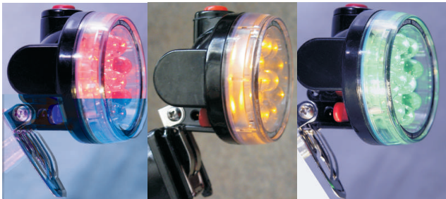
Ex ia IIC T3 IP67

Zones 0, 1, 2; Gas Groups IIA, IIB, IIC; Temperature Classes T1~T3